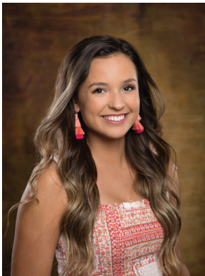
Albany Ashley Pike Central High School